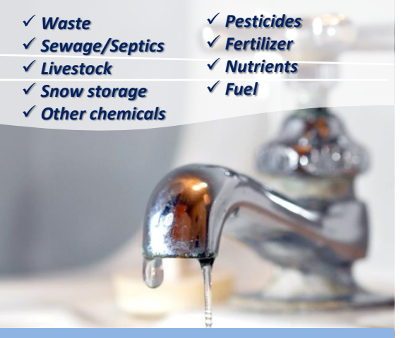
To learn more about these threats visit www.trentsourceprotection.on.ca